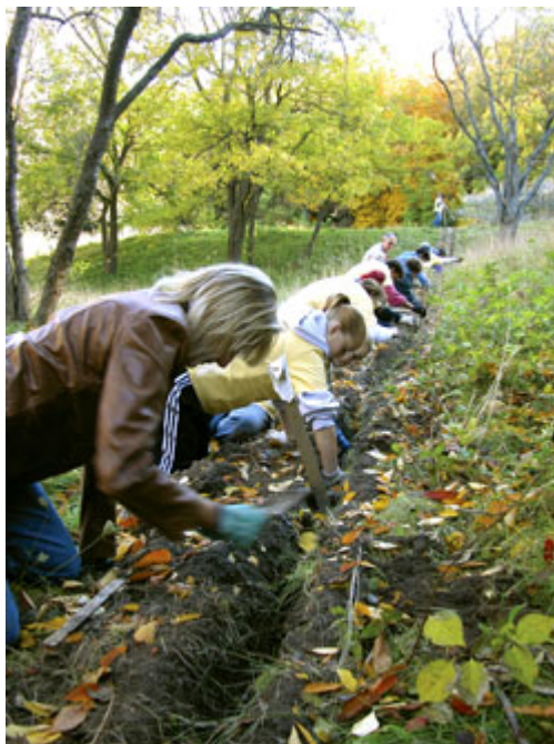
yellow daffodils. Photographs from the planting will be on exhibit in Gallery 2.