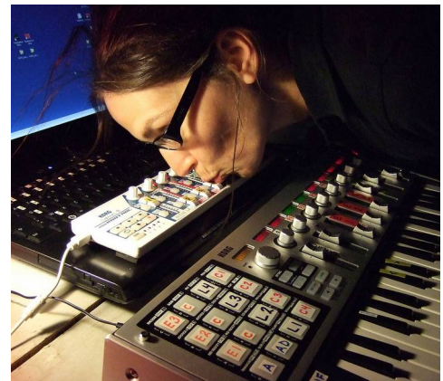
In Search of Belonging , AV Show, Italy 2009